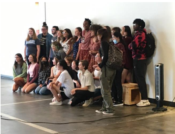
Young Writers Program High School Summer Writing Intensive

ESU was invited to attend the End-of-Week Reading event for the High School Summer Writing Intensive on July 29, so I had the opportunity to talk about ESU to the group assembled at the new Lighthouse facility in northeast Denver in a warehouse redeveloped as a multi-use space. Twenty students read the amazing prose and poetry they wrote during the week, and the room was full of energy, not just from them but also from the Camp instructors, the Lighthouse staff and the students' families and friends. Several parents spoke to me afterward and they look forward to our next Writing Competition prompt!