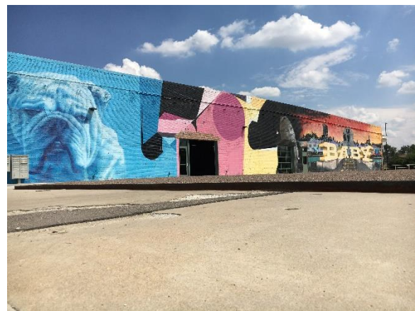
Lighthouse Writers Workshop 3833 Steele Street, Denver