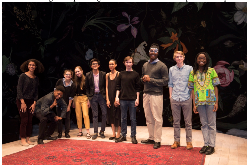
The ten finalists chosen from among 55 semi-finalist competitors at the 2017 English-Speaking Union National Shakespeare Competition.