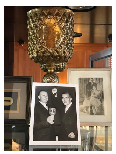
Current picture of the contents from the china cabinet pictured above. Includes the Henley Regatta Cup.