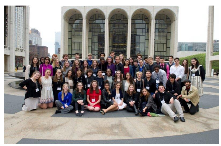
The 55 semi-finalists at the 2016 English-Speaking Union National Shakespeare Competition in New York City.