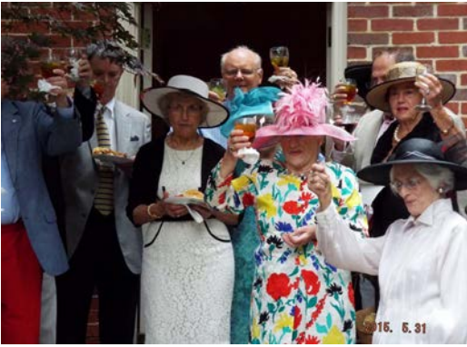
Our traditional toasts to the Queen and the President.