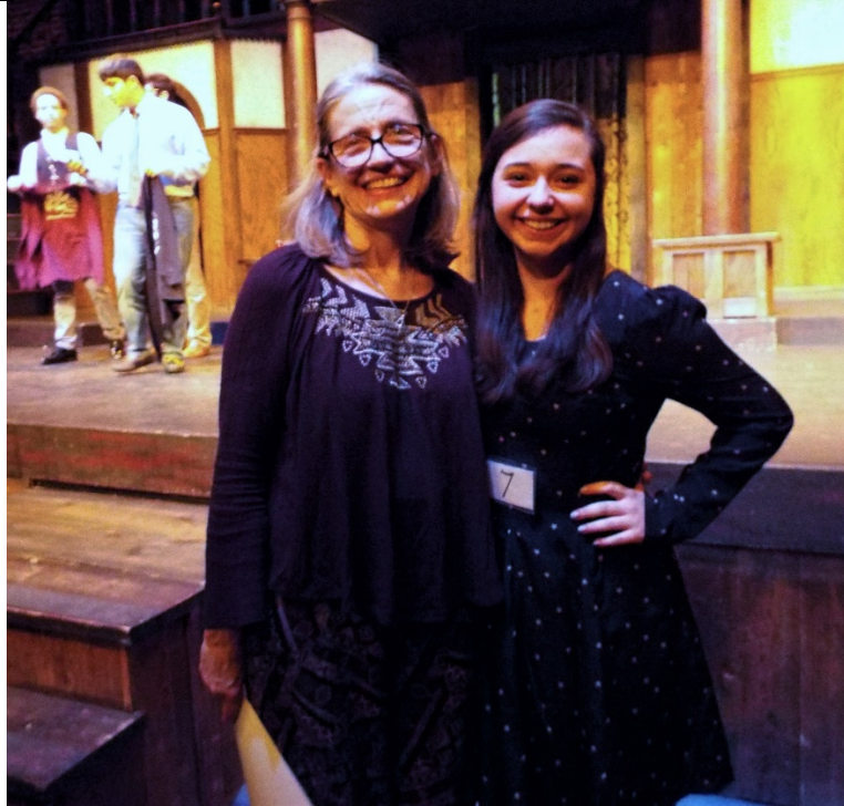
Winning students and their teachers.

Getting young people excited about Shakespeare and the English Language goes to the heart of what our organization is about. Those of us who work on the Shakespeare Competition Committee feel blessed to take part. It's deeply satisfying to make a difference in young people's lives. (Contact us if you'd like to help.)