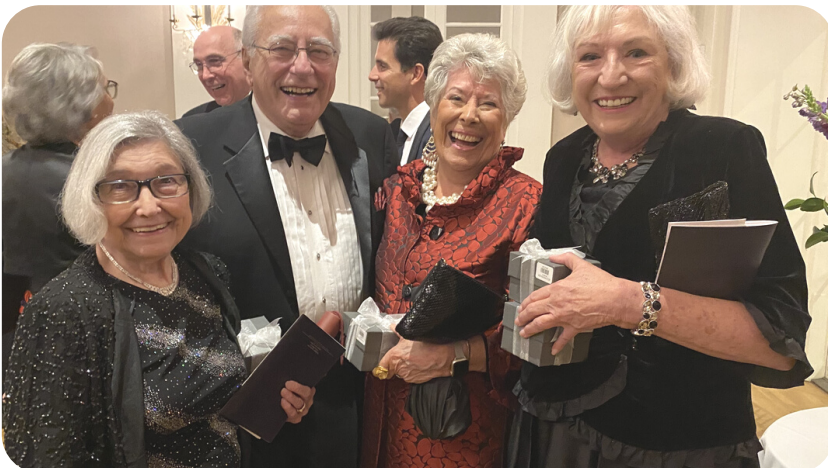
Representing our Central Florida Branch at the 2022 E-SU Gala (pictured left to right):