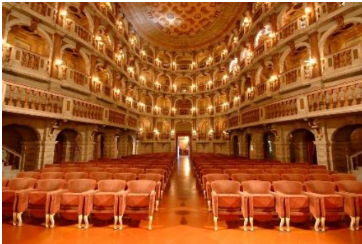
Teatro scientifico del Bibiena

The theatre, no longer with tiers as in the Renaissance, has a bell-shaped ground plan and is laid out in orders of wood – carved theatre boxes in line with the types of structure invented in the 17th century and fashionable at the time. The classical façade was designed by Giuseppe Piermarini to whom the room on the first floor of the theatre is dedicated. It opened on 16 January 1770 by Wolfgang Amadeus Mozart. Barely 14 years old, he arrived in Mantua as part of his first Italian tour to inaugurate the splendid theatre by giving a memorable concert.