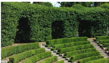
Gardens at Villa Rizzardi