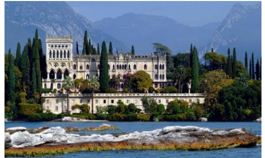
Isola del Garda