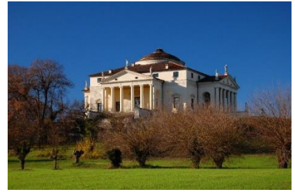
Villa La Rotonda

Villa Almerico Capra Valmarana, or informally known as “La Rotonda,” is universally considered one of the most important works of Andrea Palladio, and of the entire Renaissance. La Rotonda is now the property of the Counts of Valmarana.