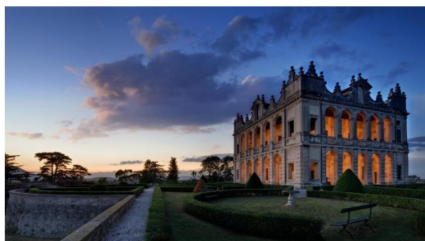
Villa Emo Capodilista

The rooms and the loggias in the villa are embellished with “grotesque” decorations, as well as scenes and characters from Roman history and mythology. The lovely villa is surrounded by geometric gardens and, of course, the vineyards. It is still owned by the Conte Emo Capodilista.