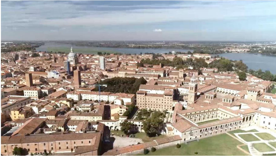
Palazzo Ducale, Mantova

Monday, September 23, 2024 VERONA- MANTOVA-VERONA