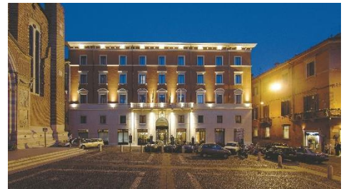
Due Torri Hotel

The superb quality of the furnishings and the professional service are highly valued by its illustrious clientele, making it the most renowned five-star hotel in Verona.