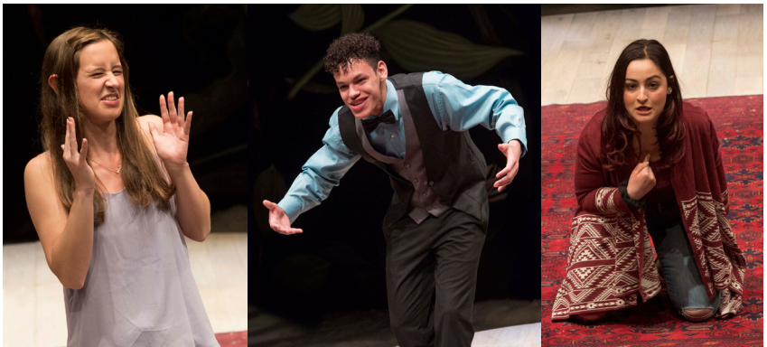
2017 NSC contestants

Television appearances include Doctor Who , Waking the Dead , Luther , Casualty , Doctors , Criminal Justice , Holby City and Blair and in the following films: The Duel , Friends and Enemies , And When Did You Last See Your Father? , If Only and Little Voice .