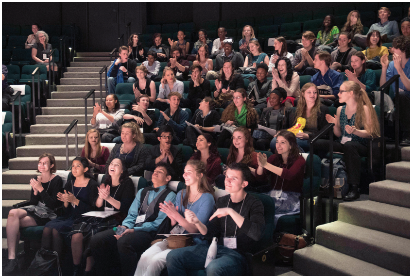
2017 NSC contestants