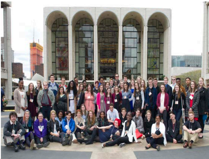
2015 National Competition contestants in front of the fountain at New York City's Lincoln Center.