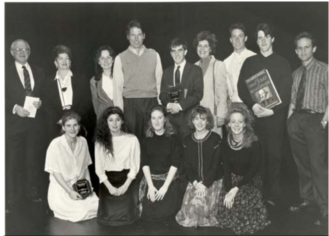
Early contestants with judges Kate Burton, Christopher Reeve and Peter MacNicol.

The English-Speaking Union National Shakespeare Competition began over thirty years ago with 500 students in New York City. Now the Competition involves approximately sixty English-Speaking Union Branch communities nationwide. Annually 20,000 high school students from Honolulu, HI to Boston, MA and their thousands of teachers participate in the program. Over the Competition's history, nearly 300,000 young people of all backgrounds have discovered Shakespeare's writings and learned to earn to express his words with understanding, feeling and clarity.