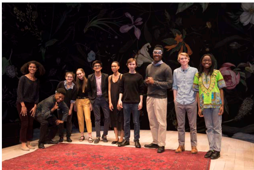
The ten finalists chosen from among 55 semi-finalist competitors at the 2017 English-Speaking Union National Shakespeare Competition.