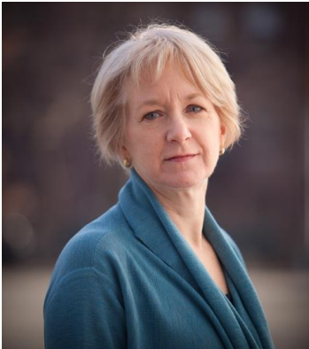
Author Carol Wallace

The English-Speaking Union 144 East 39 th Street, New York City