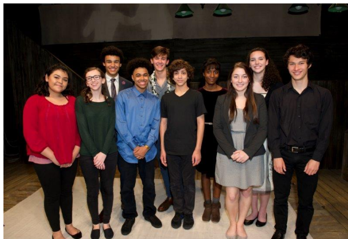
The ten finalists chosen from among 55 semi-finalist competitors at the 2016 English-Speaking Union National Shakespeare Competition.