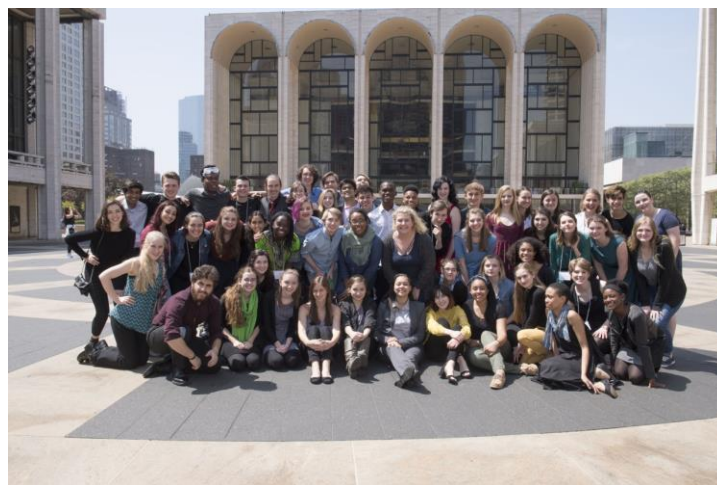
The ten finalists chosen from among 55 semi-finalist competitors at the 2017 English-Speaking Union National Shakespeare Competition.