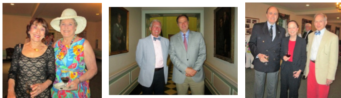
June 5th—Benefactor Reception at Valley Forge Military Academy